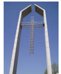
Yoido Full Gospel Church

After the Congress, the Leadership Team was able to "unwind" by embarking on a tour of key South Korean attractions, including the Yoido Full Gospel Church and its prayer mountain.