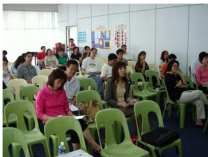
All Saints' Church Modular Training Class

In May, at the invitation of the leadership of All Saints' Anglican Church, Kuala Lumpur , Raphah Ministries began teaching a modular "Basic Course in Christian Healing Ministry" at their church in Cheras, Kuala Lumpur. The Course is aimed at equipping members of the congregation with a biblical framework for the healing ministry, as well as basic prayer counselling and ministry skills. Held weekly on Saturday afternoons, the class of forty-plus trainees include some who were on Raphah Ministries' inaugural Ministry Team Training Course held at Beit Raphah . The class is now in Module 2 of the Course.