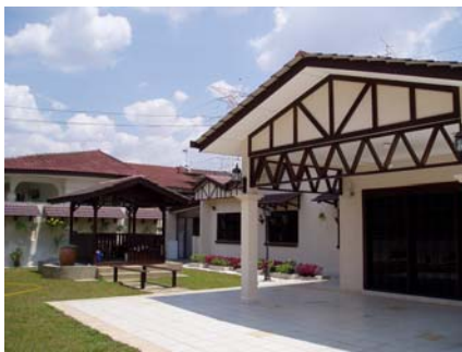
“Beit Raphah” (House of Healing)

Raphah Ministries had its beginnings in a prayer support group and grew out of the desire of a number of alumni of the Ellel Ministries International Schools of Evangelism, Healing and Discipleship to establish a local ministry and training centre where believers could come and receive teaching, be trained and equipped to serve the Body of Christ.