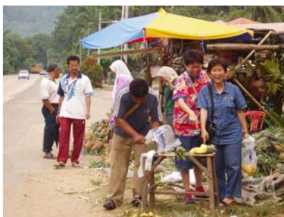
Team members supporting local fruits industry near Kuantan

shoulder in a symbolic declaration into the heavenlies of their support, unity and solidarity with the church leadership. Given the occasion, it was a special moment to see congregation members and leaders come together to make such a powerful statement!