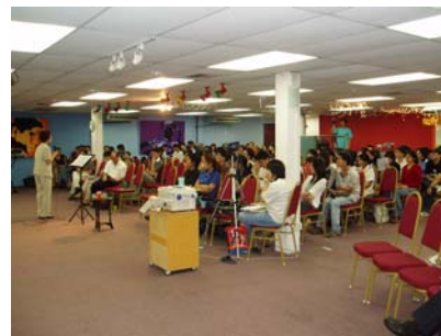
A section of the Seminar participants at Hope of God Church