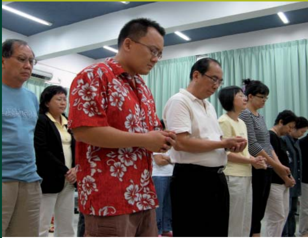
Act of Commitment and Anointing at Team Retreat 2010