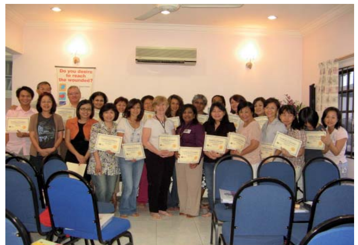
Class of 6-Day School - March 2010 (17th Edition)