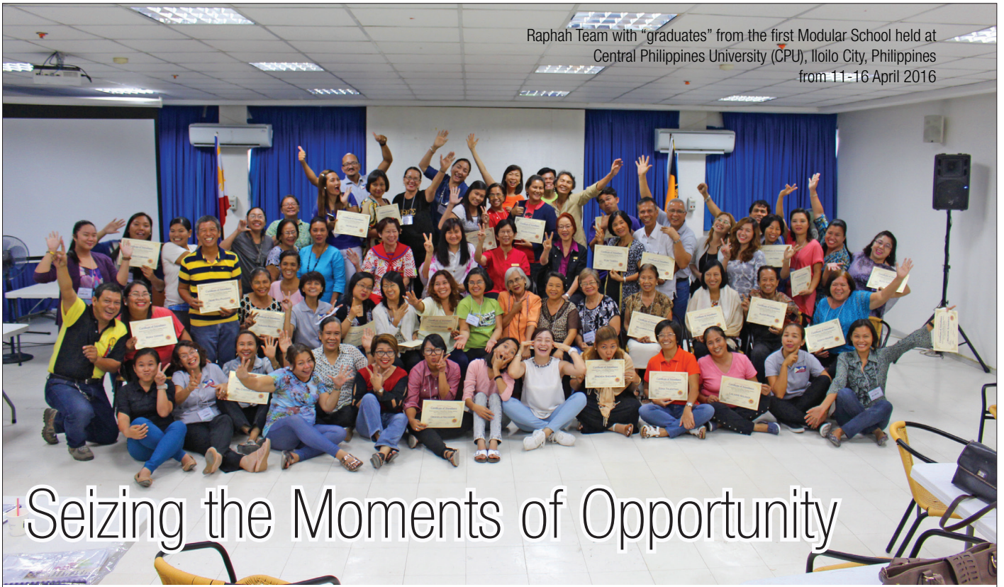
Raphah Team with "graduates" from the first Modular School held at Central Philippines University (CPU), Iloilo City, Philippines from 11-16 April 2016