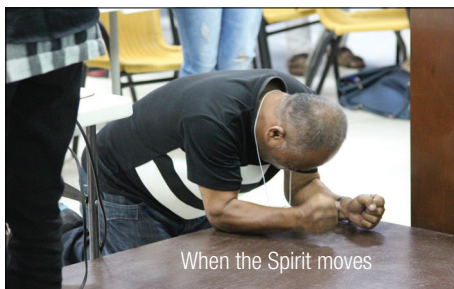
When the Spirit moves