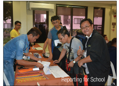
Reporting for School

Raphah Ministries is deeply honoured indeed by this endorsement of the Modular School, and give all praise to Almighty God for using Raphah Ministries to play a small part in the transformation of individuals, communities, and even a whole nation! 🍷