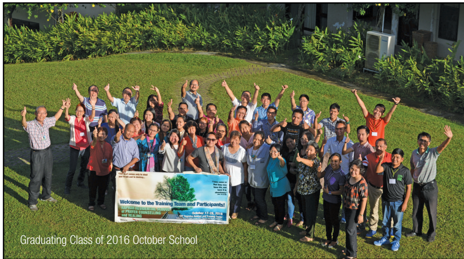
Graduating Class of 2016 October School

“ At first I was reluctant to come because of my doctrinal beliefs, but as they taught us, I became so blessed. It is a great privilege to be a part of this School. ”