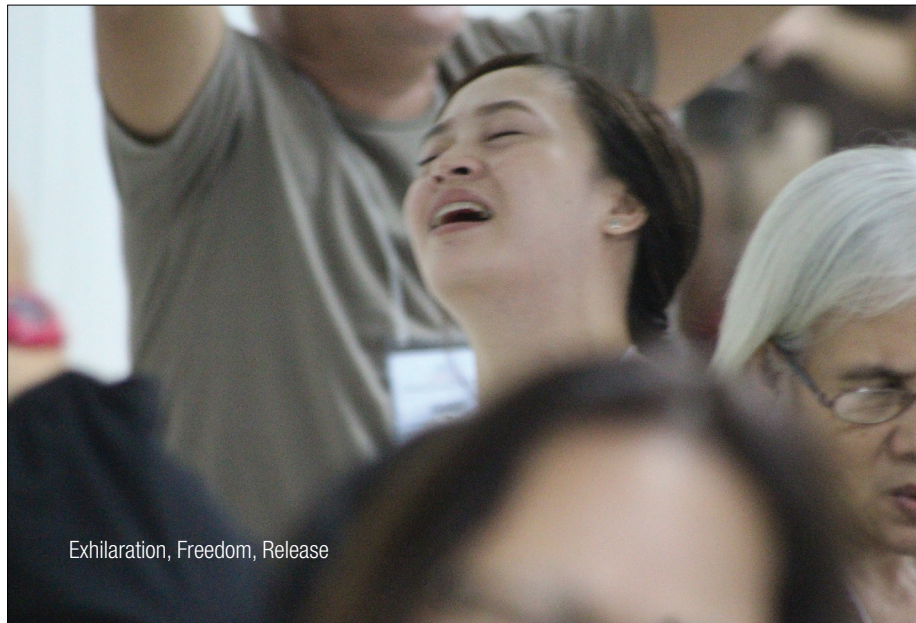
Exhilaration, Freedom, Release

Growing up in such an environment deeply shaped and affected the way I saw myself. I was also confused, because my father would, on the one