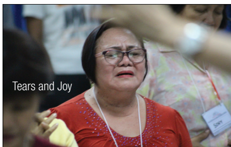
Tears and Joy