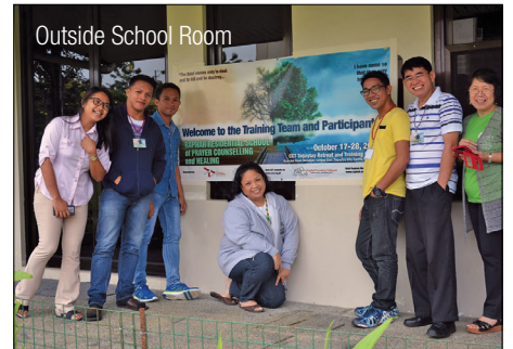
Outside School Room