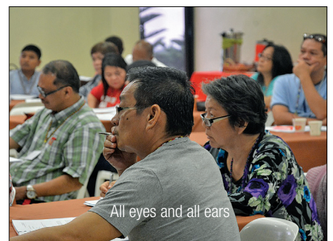
All eyes and all ears