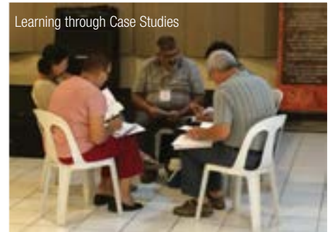
Learning through Case Studies