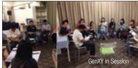
GenXY in Session

Over the past year, GenXY events have included in-house seminars, group outings as well as a spiritual retreat.