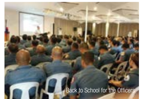
Back to School for the Officers