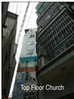
Top Floor Church