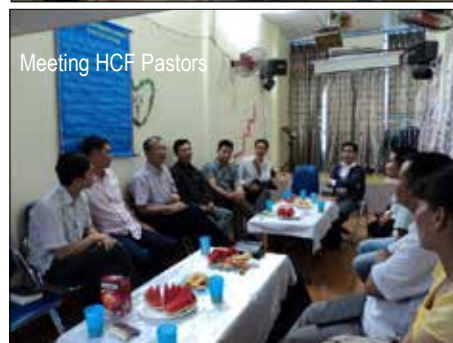
Meeting HCF Pastors

Raphah Ministries will return to Hanoi again in April 2014, to complete the programme of training begun in July and October.