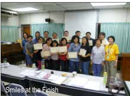
Smiles at the Finish