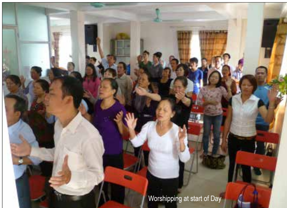
Worshipping at start of Day