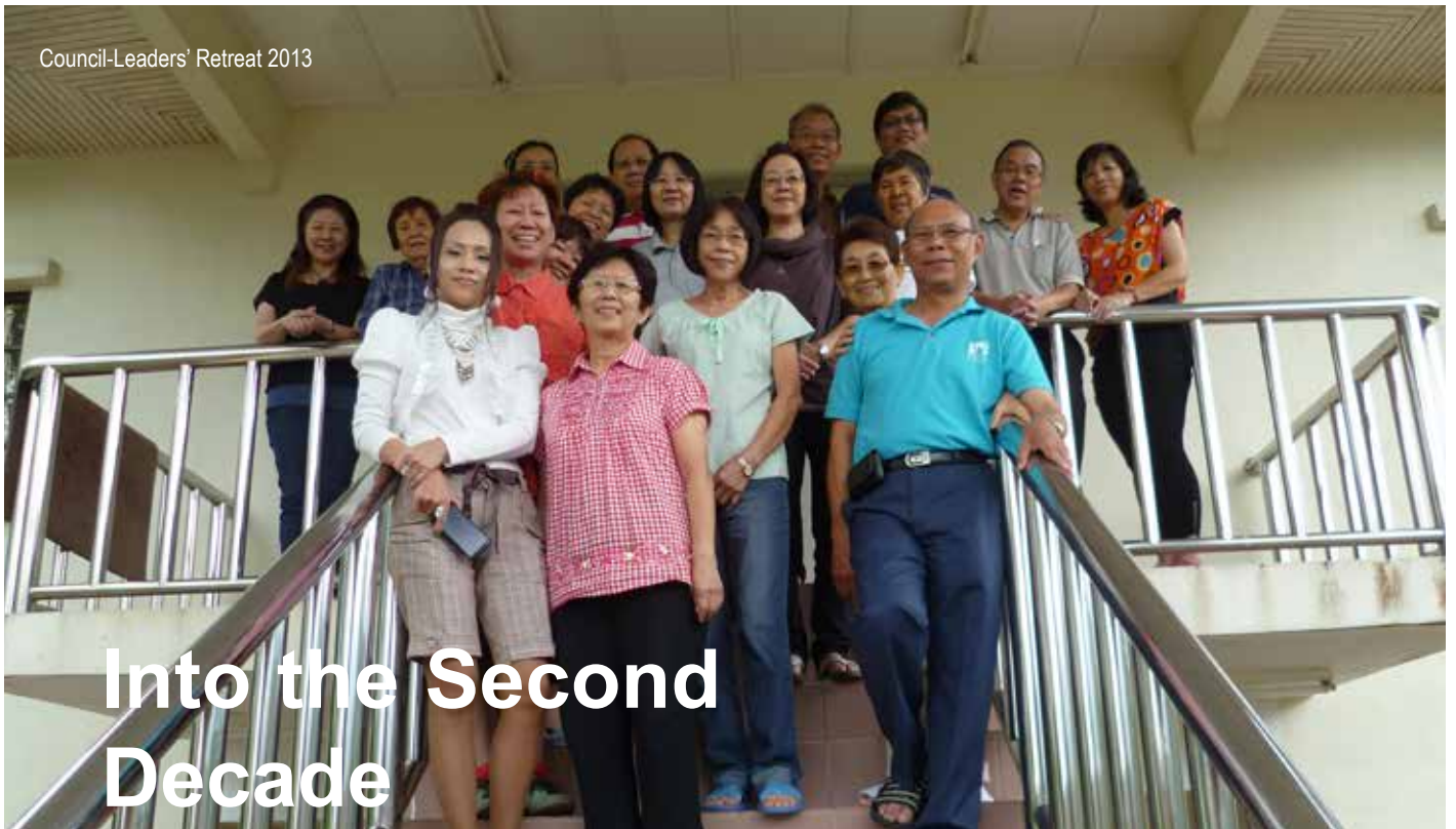
Council-Leaders' Retreat 2013