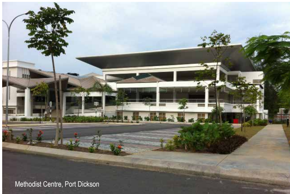
Methodist Centre, Port Dickson

“ As the Father has sent Me, I also send you. ”