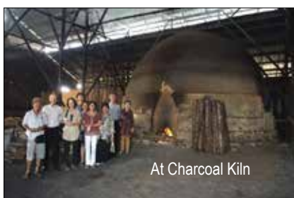
At Charcoal Kiln