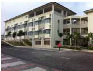
Accommodation Block, Methodist Centre