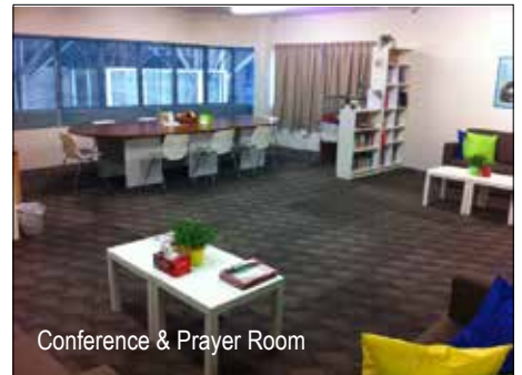
Conference & Prayer Room