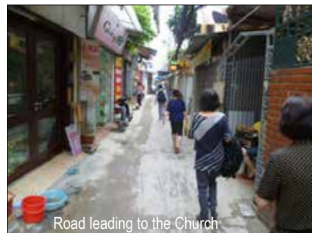
Road leading to the Church