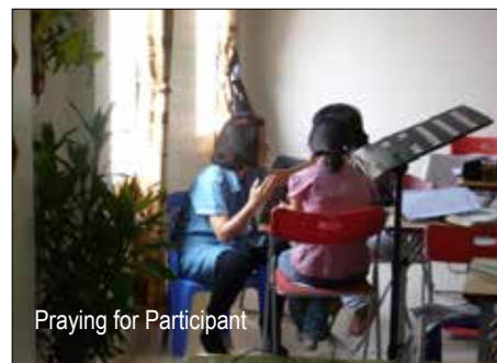
Praying for Participant

“ Thank you for loving the people of Vietnam! ”