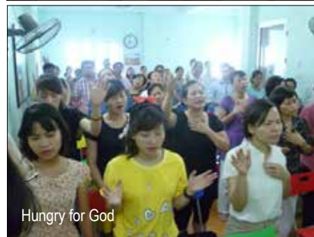
Hungry for God