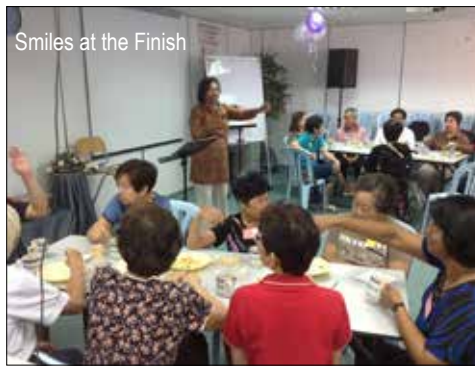
Smiles at the Finish