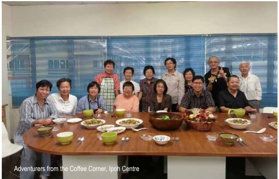
Adventurers from the Coffee Corner, Ipoh Centre