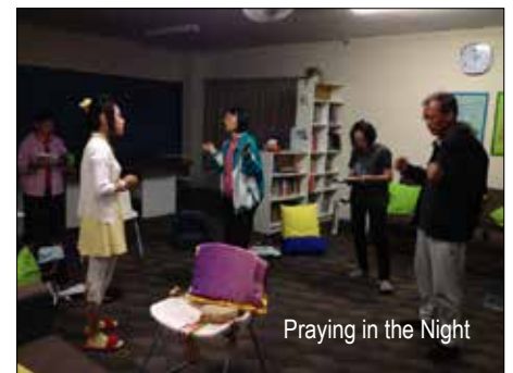
Praying in the Night

following morning—will be held on 13-14 January, 12-13 May, and 15-16 September 2014.