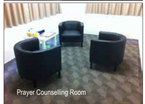
Prayer Counselling Room

“ Do not spare; ...For you shall expand to your right, and to your left. ”