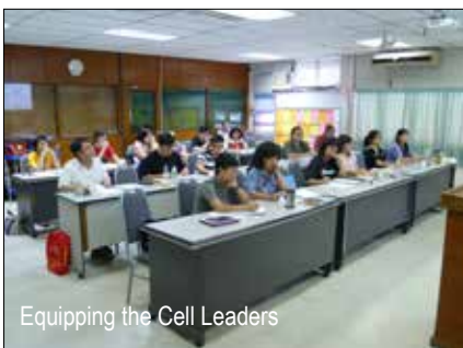
Equipping the Cell Leaders

Grateful thanks to facilitators and participants.